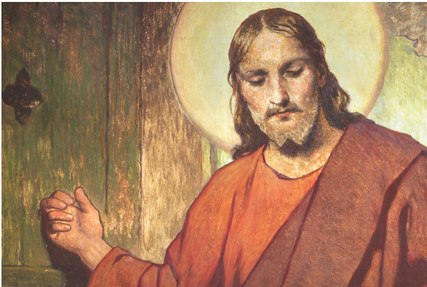
You must also be prepared, for at an hour you do not expect, the Son of Man will come. -Lk. 12:40