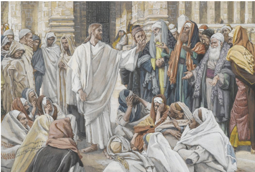
“Take care to guard against all greed, for though one may be rich, one’s life does not consist of possessions.” -Lk. 12:15