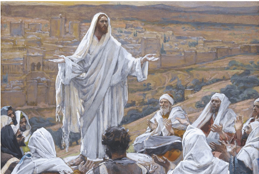
“And I tell you, ask and you will receive; seek and you will find; knock and the door will be opened to you. -Lk. 11:9