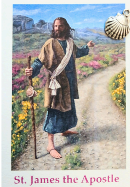
St. James the Apostle

We are honored to celebrate our parish patron, St. James the Greater , today, Sunday, July 27th! While his actual feast day was on July 25th, we decided to celebrate today with all our parish family!