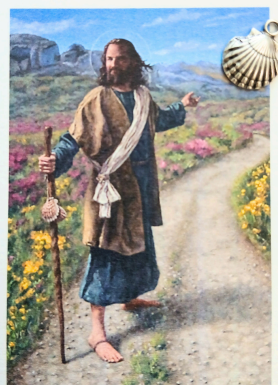
St. James the Apostle

Let us come together in prayer and joy as we celebrate our heavenly patron. St. James the Greater, pray for us!