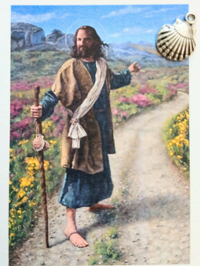
St. James the Apostle

Let us come together in prayer and joy as we celebrate the life and intercession of our heavenly patron. St. James the Greater, pray for us!