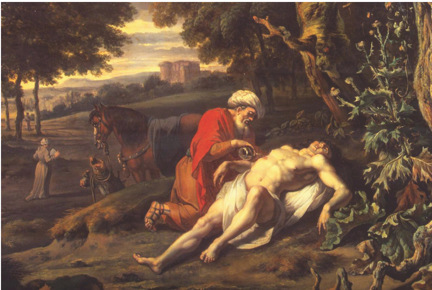
“But a Samaritan traveler who came upon him was moved with compassion at the sight.” -Lk. 10:33