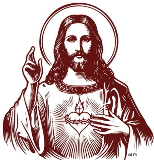
The Most Sacred Heart of Jesus June 27th