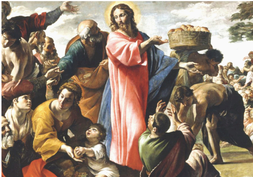
“Then taking the five loaves and the two fish, and looking up to heaven, he said the blessing over them, broke them, and gave them to the disciples to set before the crowd.”-Lk. 9:16