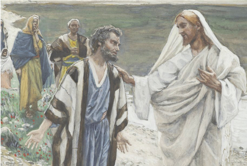
[Jesus] said to him, “Follow me.”- Jn 21:19b