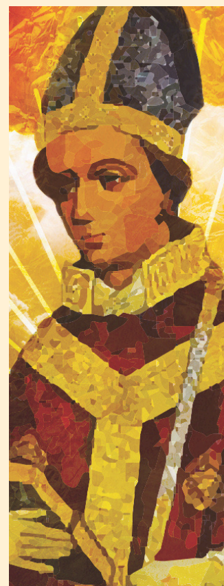
St. Stanislaus April 11

For scheduling information visit our website!