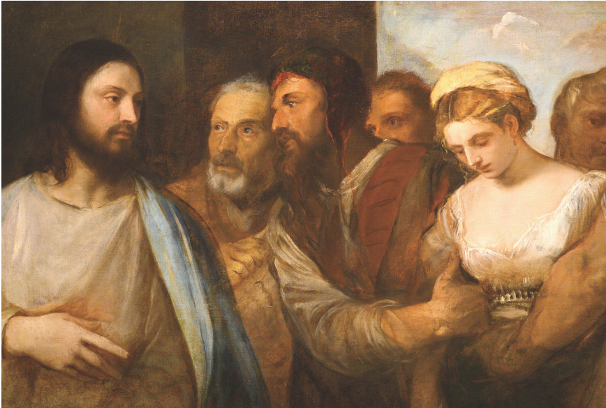
“Let the one among you who is without sin be the first to throw a stone at her.” -Jn. 7:8